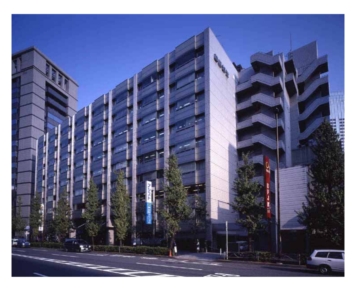
Appendix. 3 Photograph of Fujita Kanko Toranomon Building