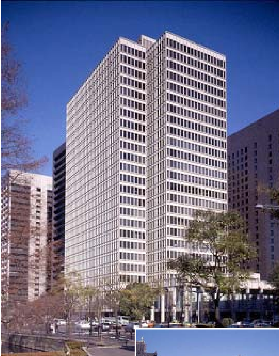
Photograph of the Resona Maruha Building